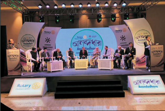
A view of Dias