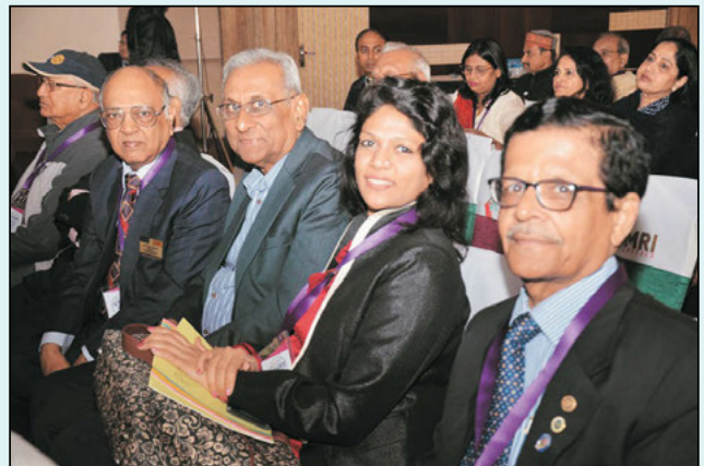
Members attending the District Conference