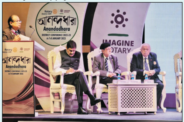
MC conducting the session