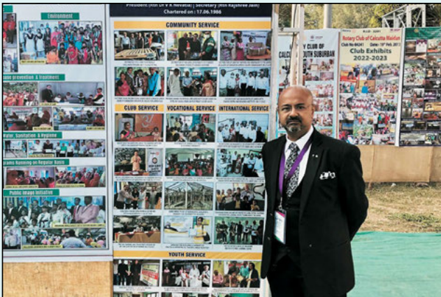
Club Exhibit-2023 being displayed at District Conference-2023