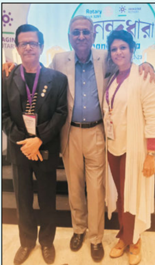
RCCM members had a good time for all 3 days